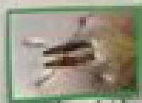
water skimmer / pond skater