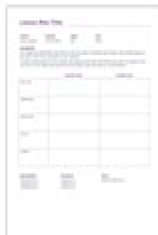
Daily lesson planner