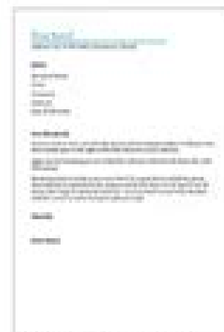
Resume cover letter Word FREE