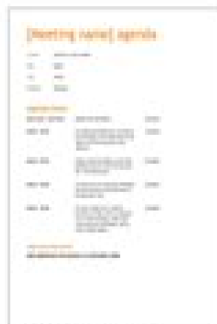
Business meeting agenda (Orange design) Word FREE