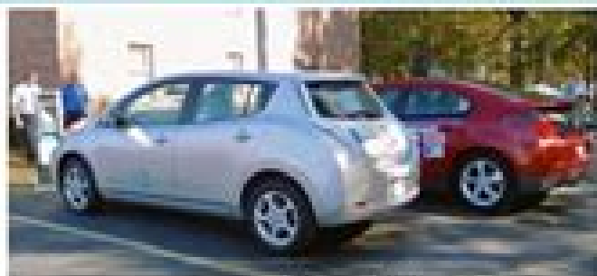
Jan - July 2013