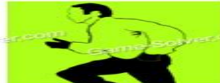
12 Years A Slave