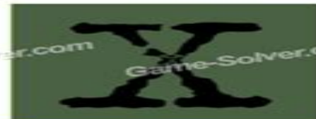
The X Files