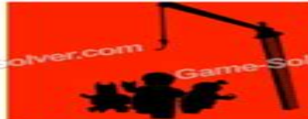
The Lego Movie