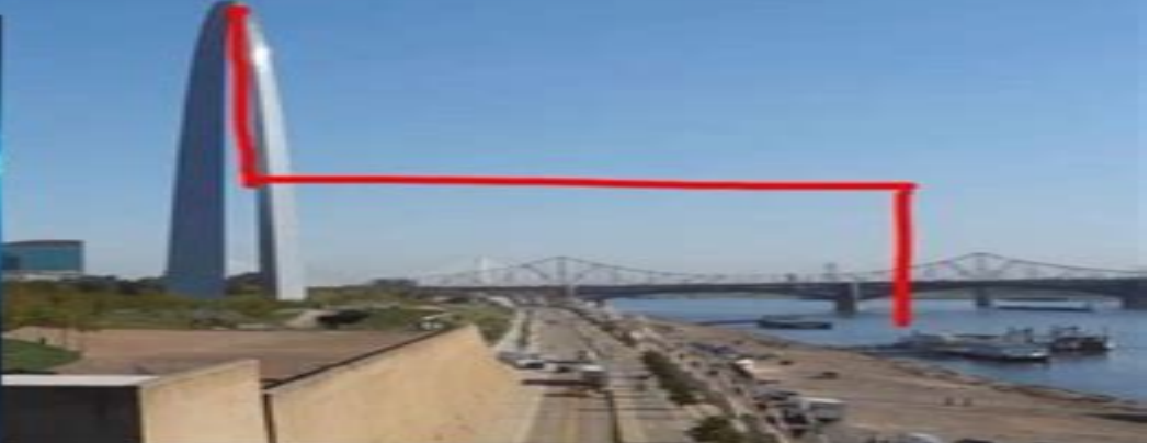
PERCY JACKSON CORE