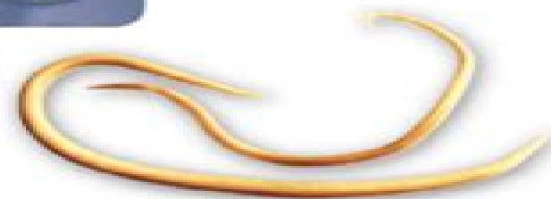
Ascarid worms (10–35 cm in length)