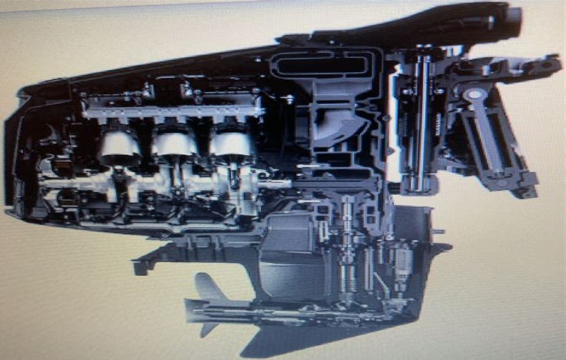
Rotax outboard Engine