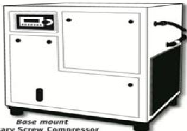
Base mount Rotary Screw Compressor

Polar Air designs and manufactures products for safe operation. However, operators and maintenance persons are responsible for maintaining safety. All safety precautions are included to provide a guideline for minimizing the possibility of accidents and property damage while equipment is in operation. Keep these instructions for reference.