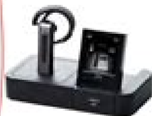
Jabra GO 6470