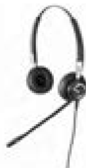
Jabra BIZ 2400 Duo