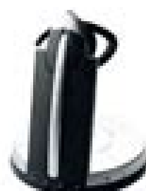
Jabra GN 9300 Duo