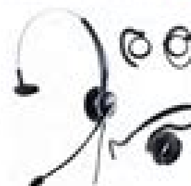
Jabra GN 2104