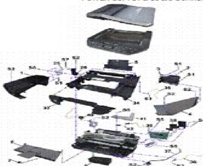
EXTERNAL PARTS POWER SUPPLY & LOGIC BOARD.