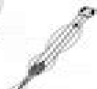
Chaetognath (arrow worm)