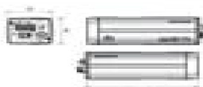
SCZ-3430/2430 (Side View)