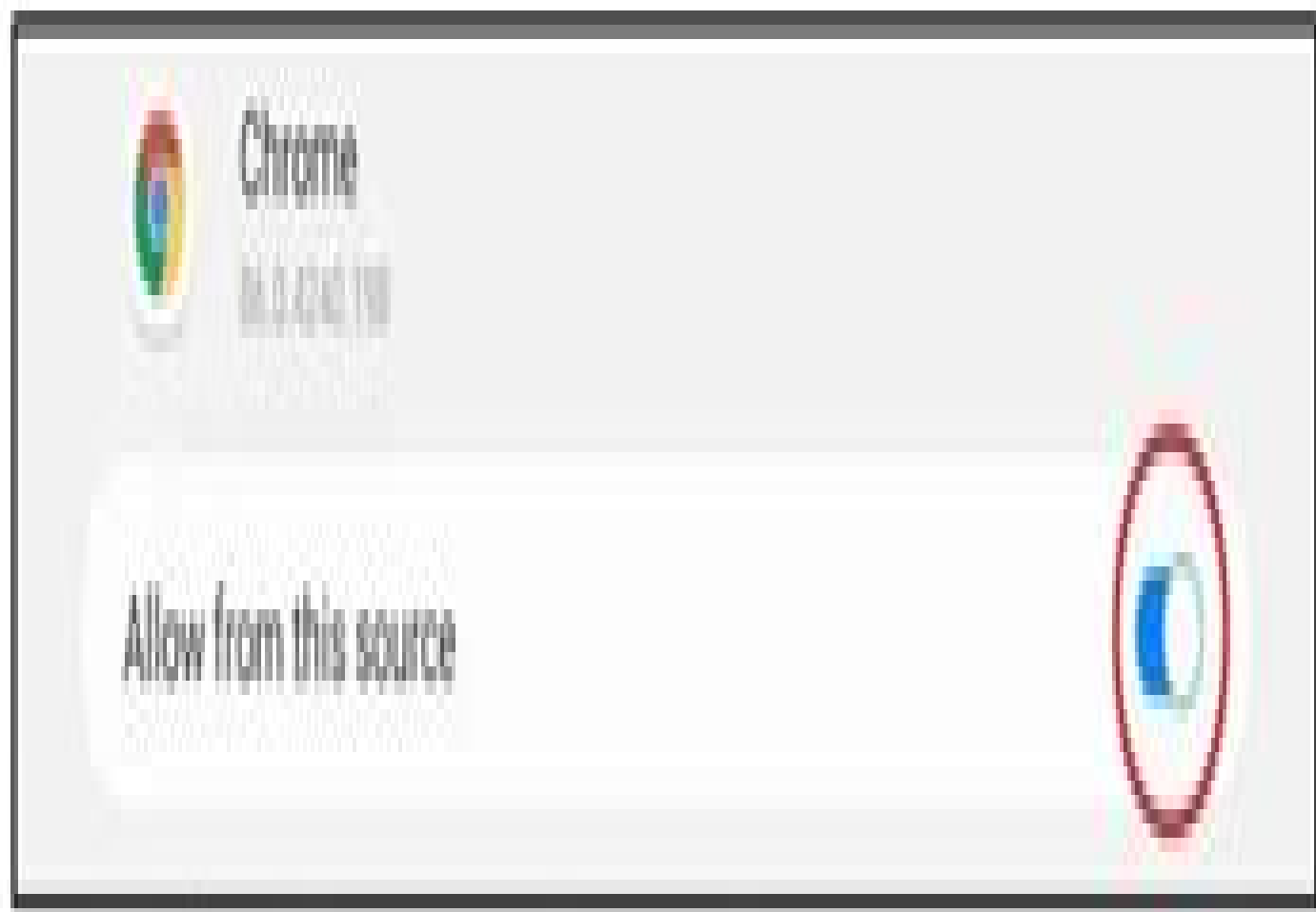
Figure 2: Example of web browser application being permitted to install unknown apps