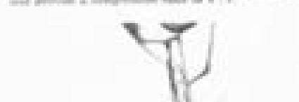
Fig. 2. Method of fitting 52 compressor ratio pistons

The diagram shows the correct position of the piston and connecting rod, ensuring that they are of the correct thickness, so that they fit in the correct position.