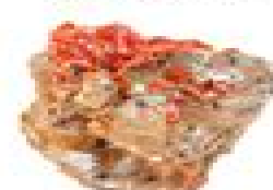
vanadinite on rock