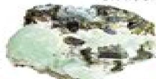
prehnite with epidote