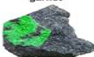
uvarovite on rock