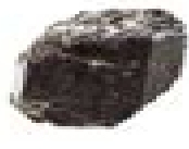
schorl (black tourmaline)