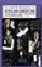
Volume 2: Realism, Naturalism, Modernism to the Present ISBN: 978-0-393-91070-4