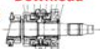
Fig. TB-27 Layout of main shaft

15. Remove the bearing from the counter gear.