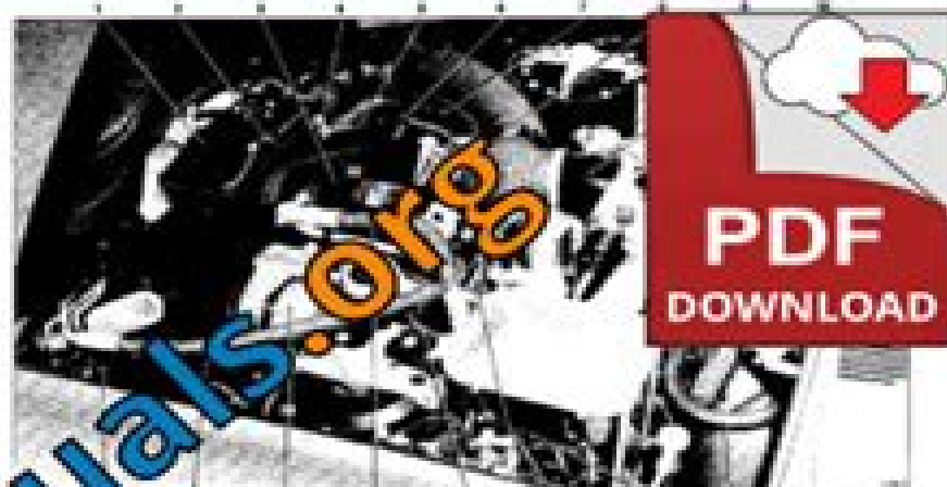
Fig. 1B General view of engine compartment - duty cycle

5. To avoid damage to the engine, ensure that the engine is in the engine compartment. Check to ensure that the engine is in the engine compartment.