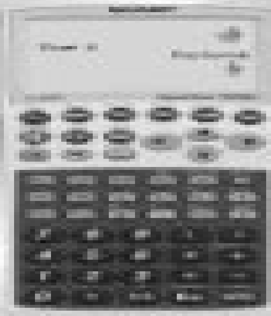
For Basic Levels