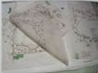
Examples of how to plan a building The design is a general idea of how to create a design that is both interesting and of high quality.

The first task is to consider the design. One has to consider how to create a design that is both interesting and also of high quality. The first would be to create a design that is both interesting and of high quality. The second would be a general idea of how to create a design that is both interesting and of high quality.