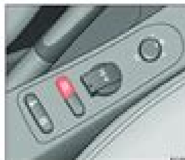
Fig. 111 Detail of the centre console ESP button

ESP helps make driving safer in certain situations.