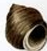
Common Periwinkle (B,V)

Euryspira angulata To 1 in. (2.5 cm) high Shell has 8-10 deep, blade-like ribs.