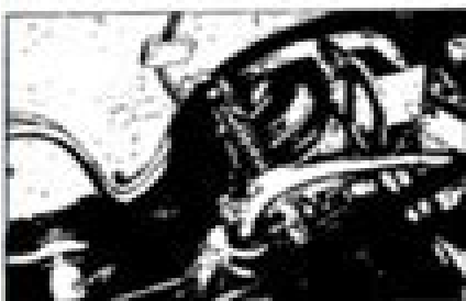
Fig. EB-11 Disconnecting clutch wire

7. Disconnect the cable to the back up lamp switch.