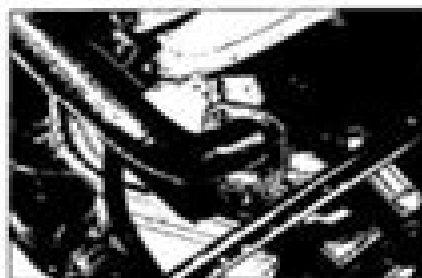
Fig. EB-12 Removing front tube

Remove the front, 1st gear, 2nd gear, and main drive gear. (The operation is carried out in the previous compartment.)