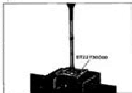
Fig. TB-29 Removing main drive bearing

18. Remove the main bearing from the main shaft by the use of a bearing puller (special tool BT-27100000) and a pin.