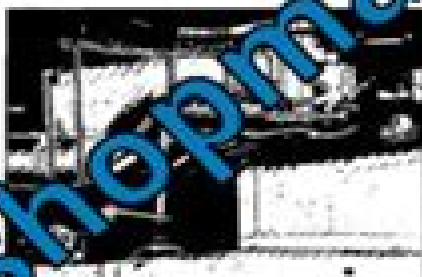
Fig. EB-13 Removing exhaust control rod

12. Remove the front engine mounting installation bolt.