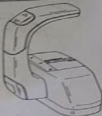
COMMANDER 3000 SINGLE HANDLE CONSOLE MOUNT REMOTE CONTROL