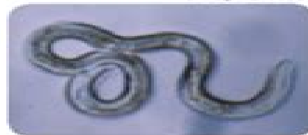
Vinegar eel (2 mm in length)