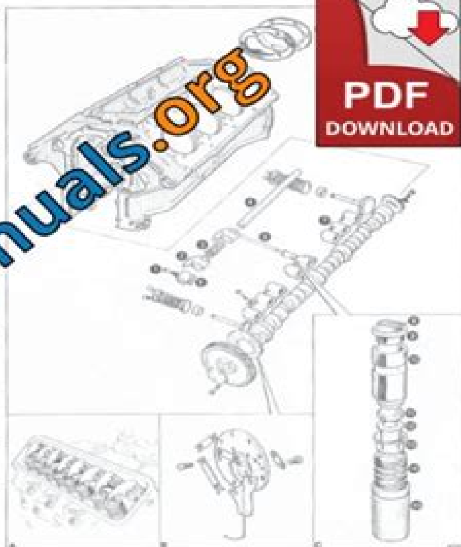
Fig. T13-5 Gearshaft and valve mechanism

Check the roller clutch inner race and the bush for scoring or wear.