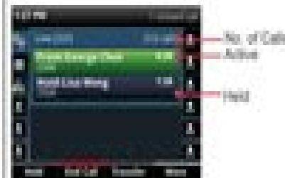
No. of Calls

If your phone has one or more calls, you can access Calls view.