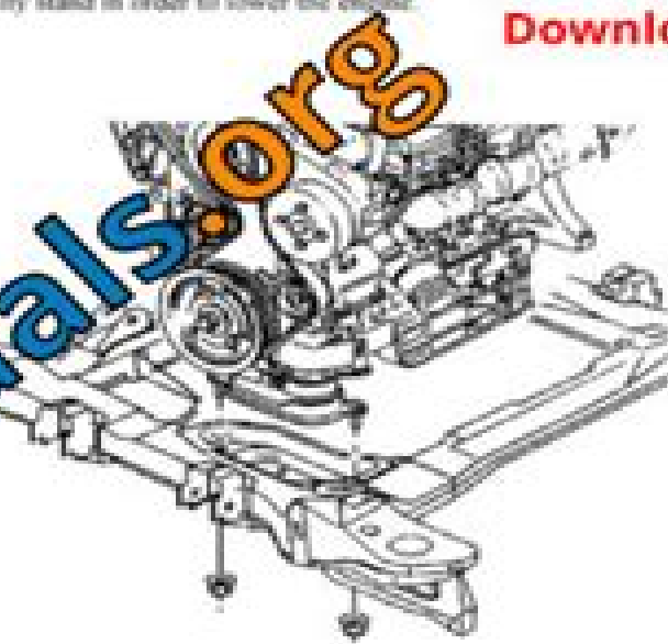
Fig. 31: Identifying Engine Mount Lower Nuts