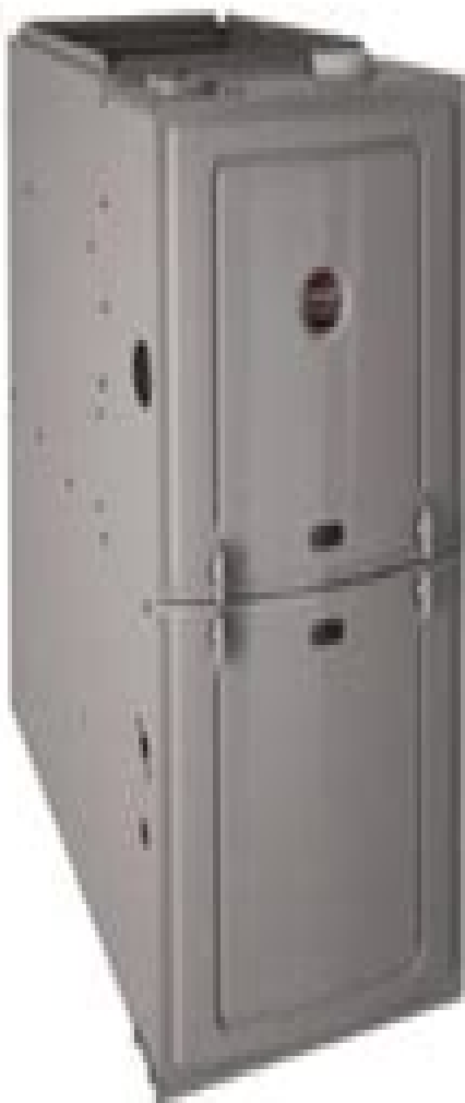
INDOOR UNIT (FURNACE/AIR HANDLER)

Model & Serial Number Location Inside Top Cover