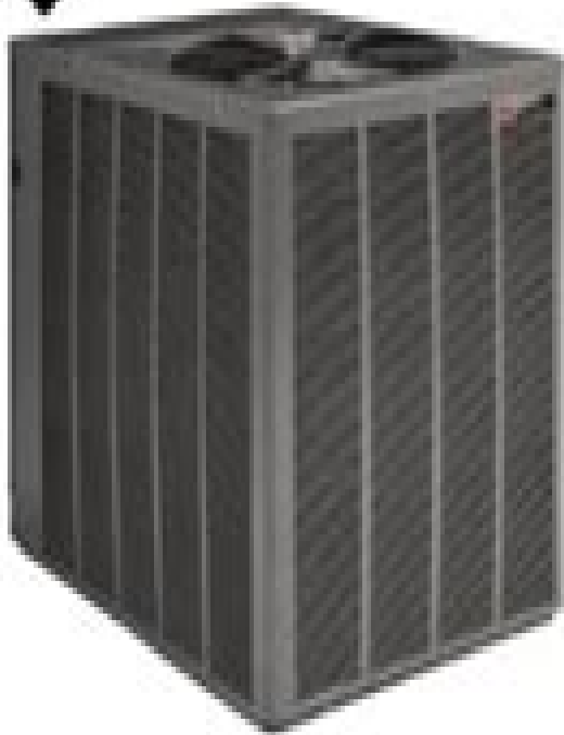
OUTDOOR UNIT (AIR CONDITIONER/HEAT PUMP)