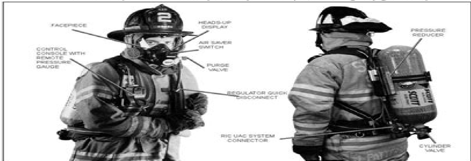
TYPICAL AIR-PAK 75 FRONT VIEW

Pressure-Demand Self Contained Breathing Apparatus (SCBA) NFPA-1981 (2007 Edition) Compliant (Including Upgrades)