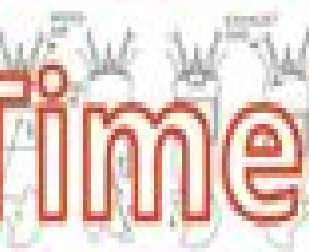
Diagram of 4-Stroke Cycle Engine