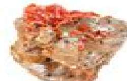
vanadinite on rock