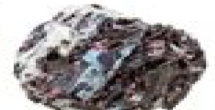
kyanite, biotite, tourmaline on gneiss