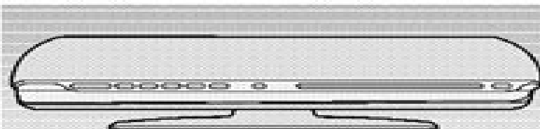
MODEL : HT-X250