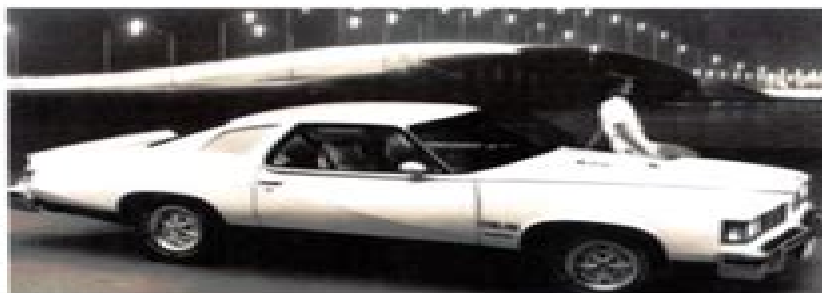
The last of the muscle cars the 1977 Can Am

Pontiac- the leader of the performance pack. No other automobile has done more for high performance than Pontiac. In the beginning there was the GTO, and as other manufacturers were shying away from high powered big engines, Pontiac step up to the plate and hit a home run in 1973 with the 455 Super Duty. The debate may go as to what was the best car, but there is no doubt that Pontiac was the Alpha and Omega of the muscle cars.