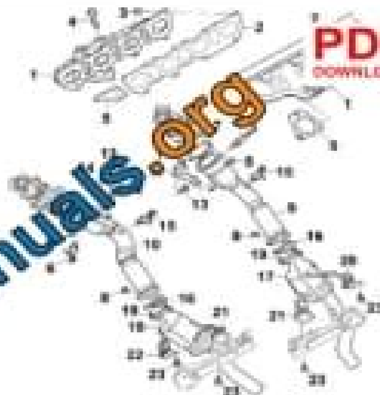
Fig. 11. Rear suspension assembly, Cayenne S