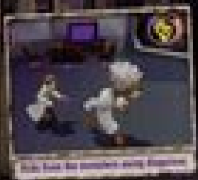
Use Scooby-Doo's powers to solve the case.