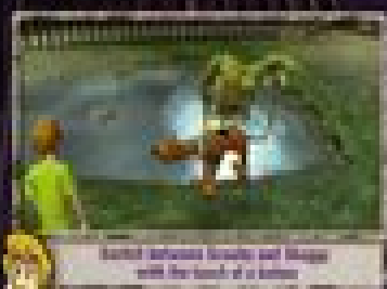
Watch Scooby-Doo battle the monster with the book of a demon.