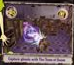
Explore games with the Tome of Doom.