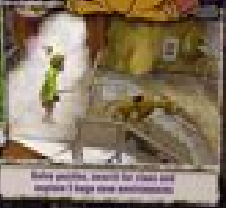
Take Scooby-Doo to the next level and explore a large new environment.