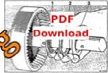
Fig. 718-15 Fitting the races and thrust bearing to the inner face of the rear internal gear 1. OVD tapered race 2. Thrust bearing 3. IVD tapered race