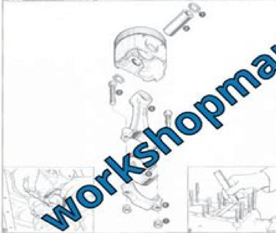
Fig. 98-7 Assembling rods and pistons