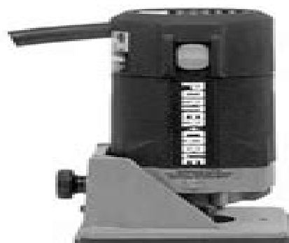
MODEL 7310 Trimmer