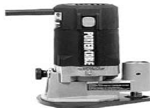
MODEL 7312 Offset Trimmer