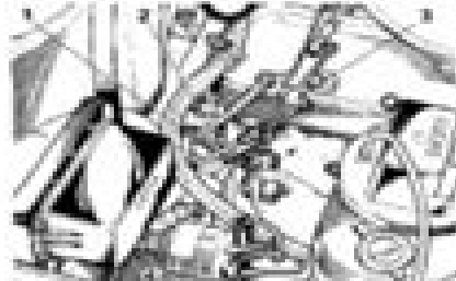
FIG. 1B COMPENSATOR LINKAGE AND REMOTE STARTER MOTOR SWITCH (dry gas)

1 Long bolt and nut 2 Control rod 3 Compensator linkage 4 Remote starter switch