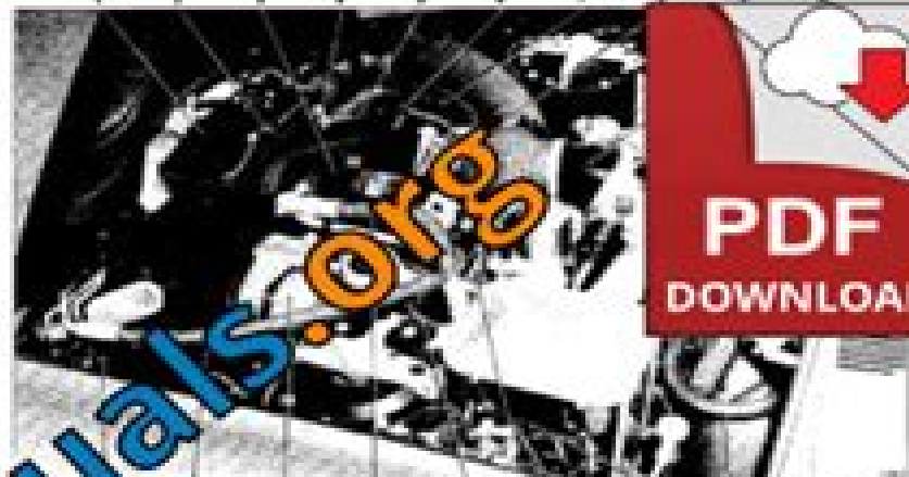
Fig. 1B General view of engine compartment - dry gas

5. To avoid damage to the rear of the engine (Fig. 1B), care should be taken not to connect the rear of the engine to the rear of the engine compartment.