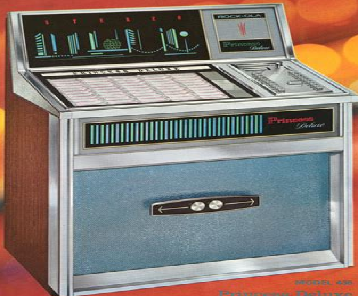
MODEL 435 Princess Deluxe ROCK-OLA