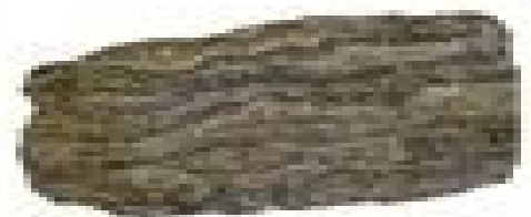
With lines in it