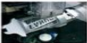
With rotary table