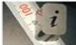
Micro finish cutting