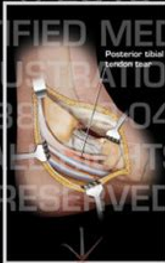
C. Repair of Posterior Tibial Tendon Tear with Graft Tendon