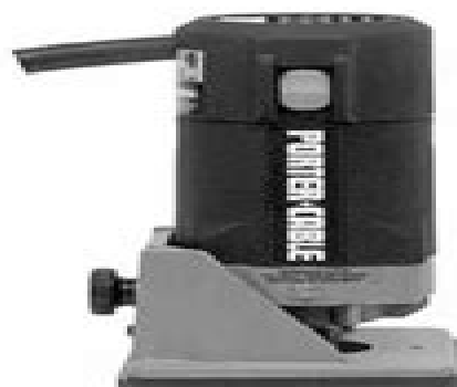
MODEL 7310 Trimmer