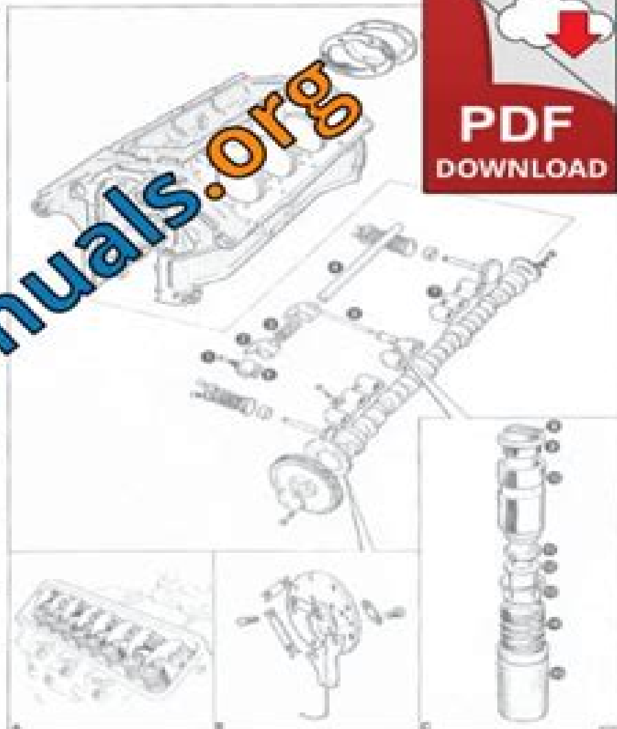
Fig. T13-1 Gearshaft and valve mechanism