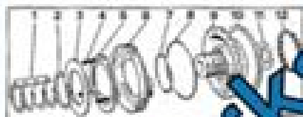
Fig. T13-4 Center support assembly