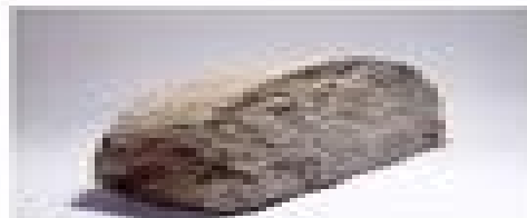
Flat on one side