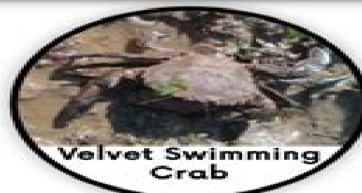
Velvet Swimming Crab