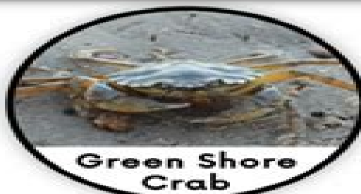
Green Shore Crab