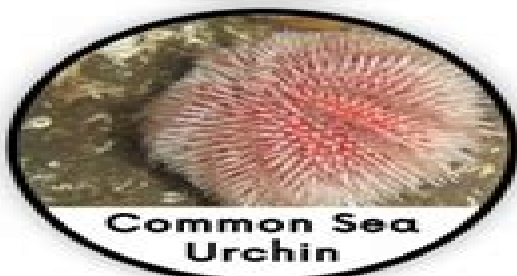
Common Sea Urchin