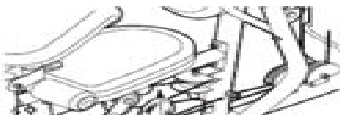
Serial Number Decal (under seat)

Write the serial number in the space above for future reference.