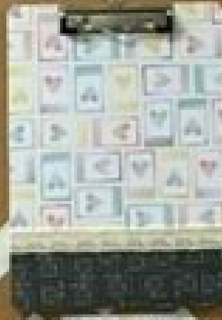
Young Women 1