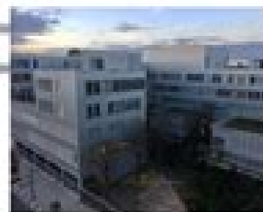
Climatisation des locaux raccordés au réseau