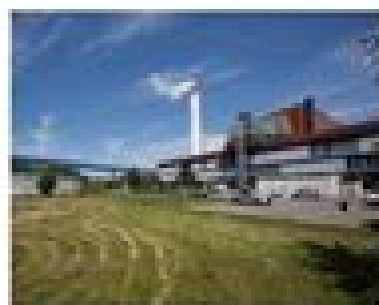
Centre de valorisation énergétique